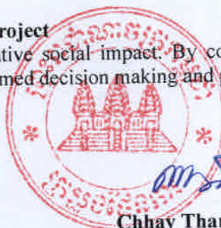
Chhay Than Senior Minister Minister of Planning

No impact on environment. No negative social impact. By conducting the census, many aspects will be improved based on informed decision making and planning.