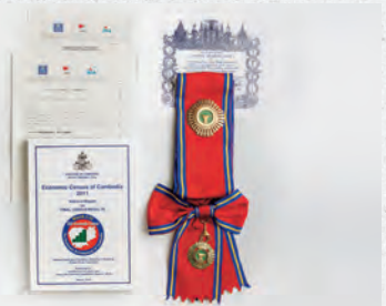
Royal Order of SAHAMETREI. Grand Cross (Cambodia)

Posters and exhibitions like overseas materials related to the Population Census