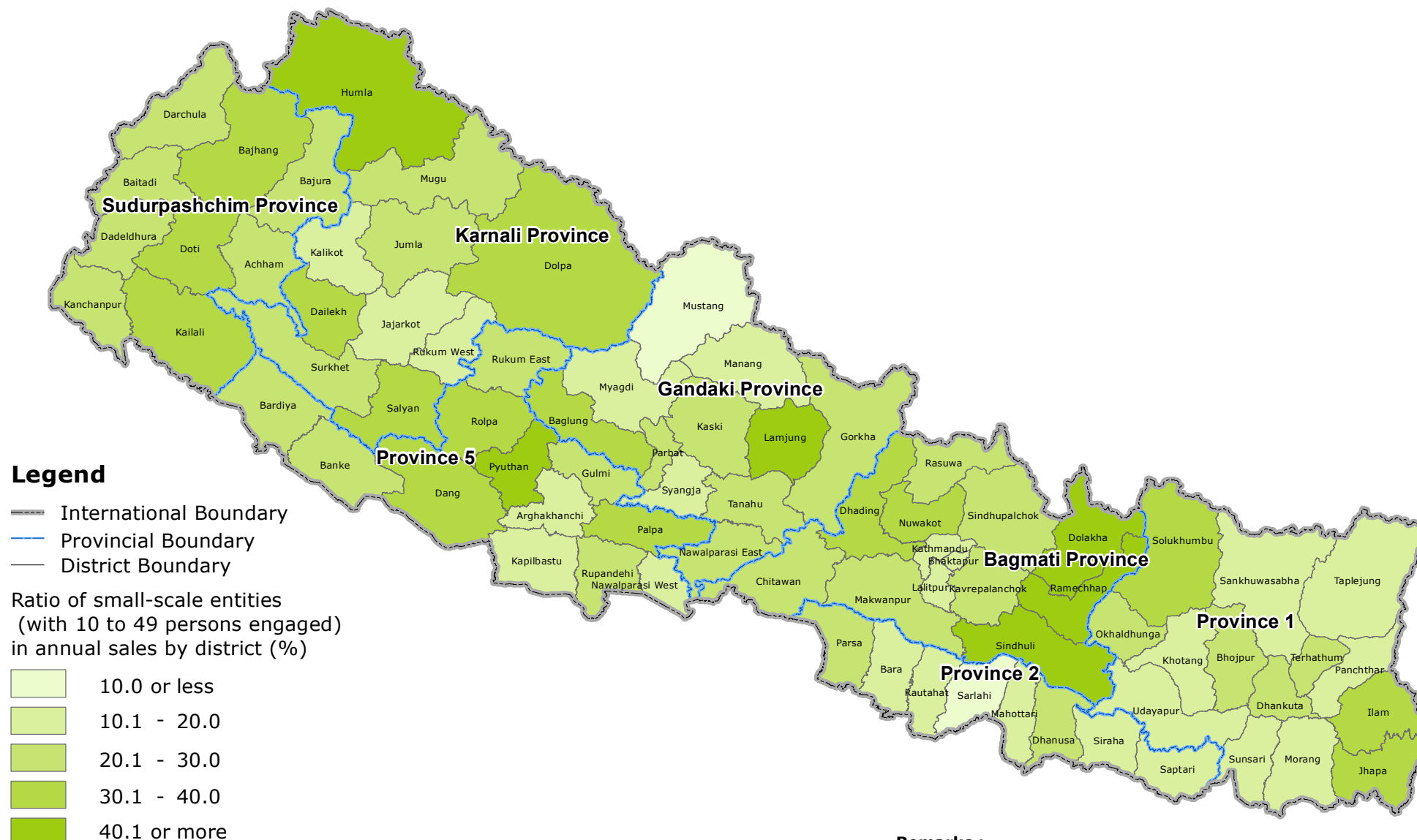
Map 2. Ratio of Small-Scale Entities in Annual Sales by District (2018)

Herein, small-scale entities are tentatively classified by using number of persons engaged.