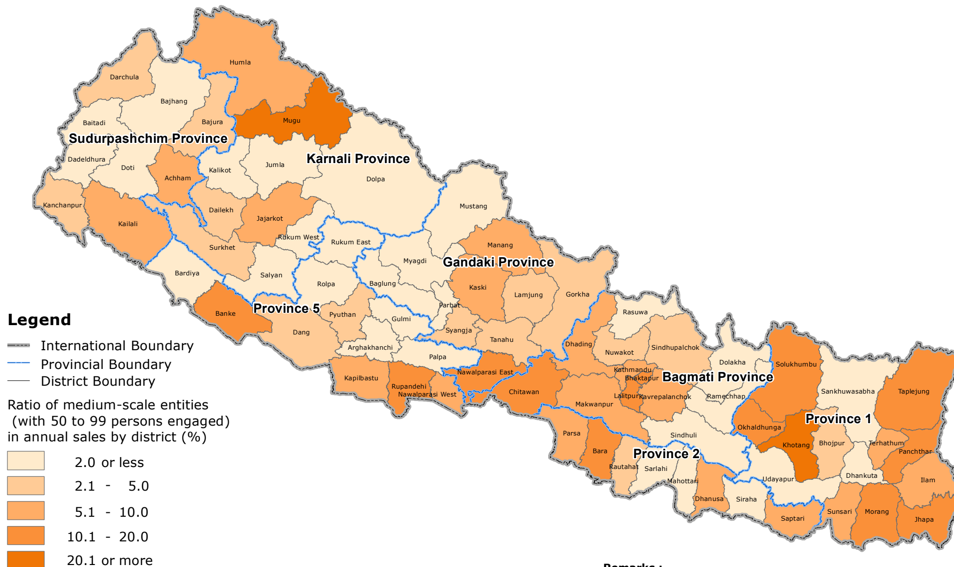
Map 3. Ratio of Medium-Scale Entities in Annual Sales by District (2018)

Herein, medium-scale entities are tentatively classified by using number of persons engaged.