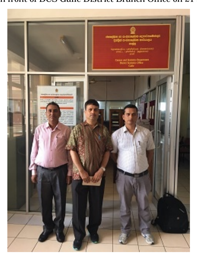
Photo 6. In front of DCS Galle District Branch Office on 21 Sep. 2017