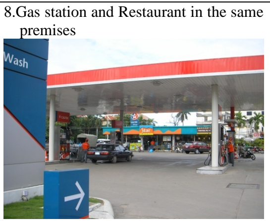
They are located in the same premises but their owners are different.

A sweet shop at this side and a stall for snack stall at the other side share the earth floor of this house. They are the establishment because of being controlled by the different owner.