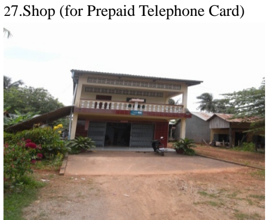
This looks like a house but sells prepaid telephone cards according to the sign board on the handrail of the veranda.