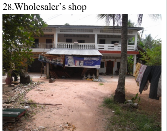
This looks like just the place for building materials. But, according to the owner of this place, he sells the window frames to construction companies.